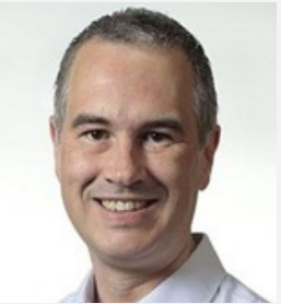
KEVIN HALL SENIOR INVESTIGATOR NATIONAL INSTITUTES OF HEALTH @IRPATNIH