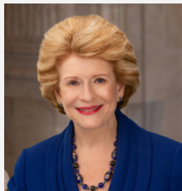
THE HONORABLE DEBBIE STABENOW UNITED STATES SENATE @SENSTABENOW