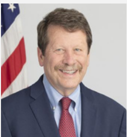
DR. ROBERT M. CALIFF 25TH COMMISSIONER OF FOOD AND DRUGS U.S. FOOD & DRUG ADMINISTRATION @DRCALIFF_FDA